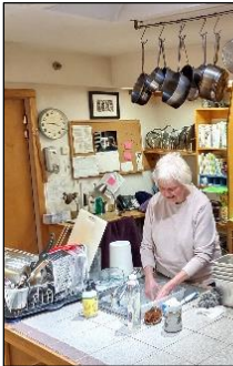
Some of our kitchen staff working and planning