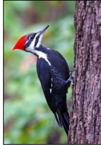
The pileated woodpecker

In the Native American tradition, the woodpecker's drumming is connected to the heartbeat of the earth. Its drumming announces changes and new rhythms coming into our life. In the European folk tradition, the red head signifies the waking of new mental faculties.